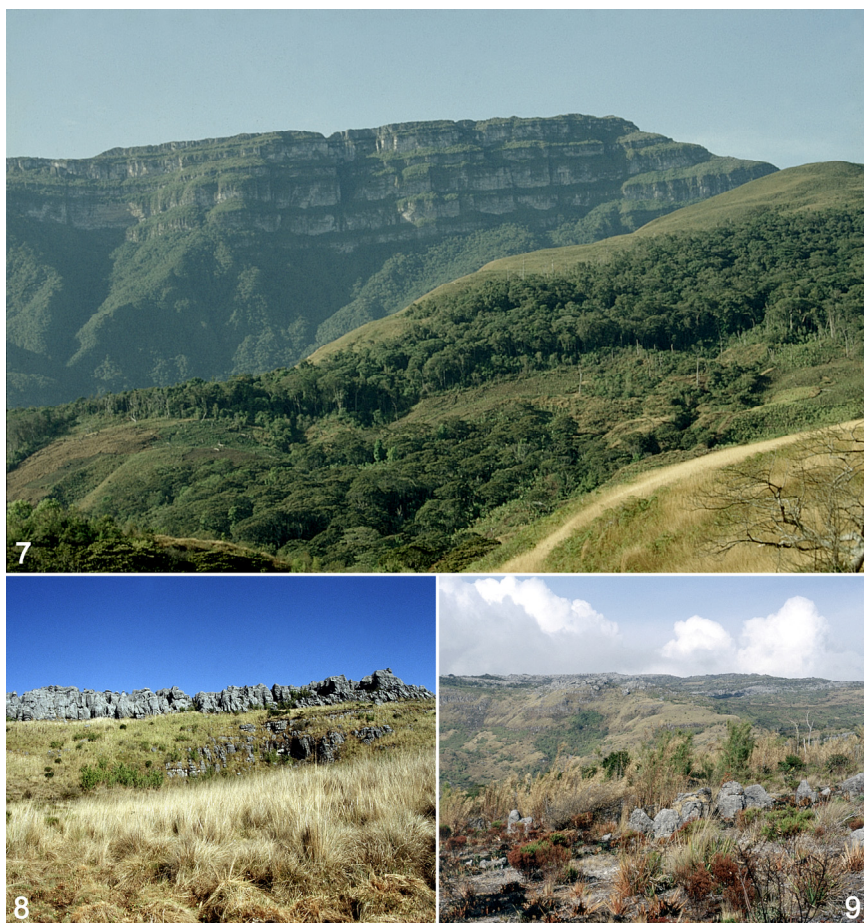
Figures 7-9. Cerro Pintado on the Colombian-Venezuelan border. 7) View of the Colombian slopes of the Cerro Pintado, a monumental limestone table that reaches 3300m in the Sierra de Perijá; 8) view of the paramo of Cerro Pintado with limestone blocks emerging on top (2-10m in height); yellow grasses are conspicuous during the dry season, but Chusquea remains green; 9) type locality of Dalla superargentea in the paramo of Cerro Pintado (3000-3300m); some clumps of green Chusquea can be seen to the right.