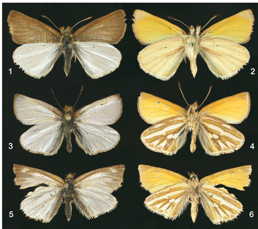
Figures 1-6. Dalla adults. 1) Dalla semiargentea , male, Colombia, 1931, dorsal surface; 2) D. semiargentea , male, same specimen as Fig. 1, ventral surface; 3) D. superargentea , holotype male, dorsal surface, data in text; 4) D. superargentea , holotype male, ventral surface; 5) D. superargentea , paratype female, dorsal surface, data in text; 6) D. superargentea , paratype female, same specimen as Fig. 5, ventral surface.

Genitalia (Fig. 10) - uncus in lateral view narrow, concave caudad of middle, strongly hooked caudad; in dorsal view narrow caudad, divided, arms parallel and closely spaced, expanding greatly cephalad to overlap large portion of tegumen as suboval plate possessing white hair tuft; gnathos shorter than uncus, narrow in lateral view, narrowing slightly caudad, interrupted by membranous area before a short sclerotized tip caudad, broad proximad in ventral view, narrowing gradually to undivided caudal end; tegumen broadly curved cephalad; combined ventral arm of tegumen and dorsal arm of saccus nearly straight; cephalic arm of saccus moderately long, thin, and curved dorsad in lateral view, cephalic end blunt in ventral view; valvae slightly asymmetrical, long ( 1.3\times length of tegumen and uncus), length about 2.6\times width, costa concave on dorsal edge toward caudal end, ampulla elongate (longer than costa), and relatively broad (length 2.1\times width), right ampulla longer and broader than left, angled dorsad, narrowing caudad to blunt caudal end, setose on both surfaces especially caudad, harpe curved dorsad and slightly inward to blunt caudal end, exceeding caudal extent of ampulla, dorsal edge finely serrate; juxta-transstilla prominent with lobate dorsal edge in lateral view, suboval in ventral view; aedeagus unadorned, moderately sinuate in lateral view, nearly straight in