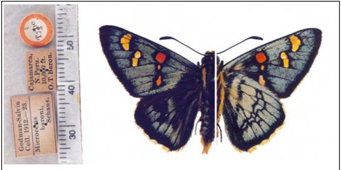
Figure 1. Male lectotype of Amenis baroni Godman & Salvin, 1895 (BMNH). Upperside at left, underside at right.